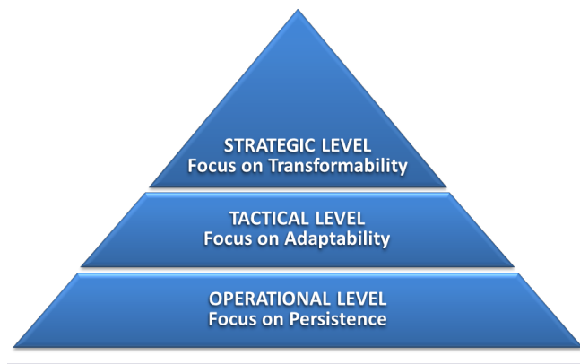
Fig. 2. Resilience roles and responsibilities at different organizational levels.

2007, Ho 2015). The different interrelated aspects of resilience (persistence, adaptability, and transformability) can occur at multiple hierarchical levels in organizations and interact across temporal, spatial, and hierarchical scales. To foster resilient essential services, we argue that the primary role of operational leadership is to foster persistence of core operational functions, the role of tactical leadership is to develop adaptability, and the role of strategic leadership is to transform the organization in a timely manner to survive and thrive amid disruptive change (Fig. 2, Table 4). We also argue that specified resilience is crucial in the lower strata of organizations while the significance of general resilience increases higher up. Operational leaders need to be aware of external threats and mindful of internal vulnerabilities to persist. In contrast, strategic leaders need to be aware of external opportunities and mindful of internal well-being of employees to transform proactively.